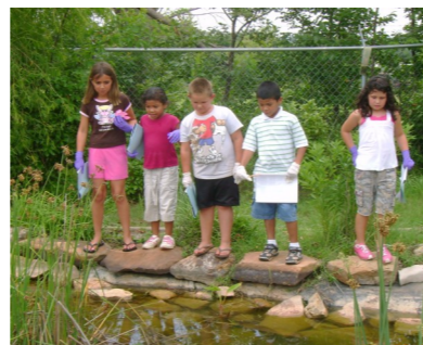
ITO's Nature Center

For additional information about the Water Pollution Control Program or about future outreach activities, please contact the Office of Environmental Services at (405)547-