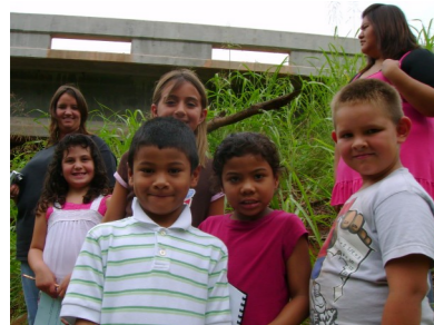
Kids at Dugout Creek