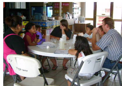
Water analysis at the Eagle's