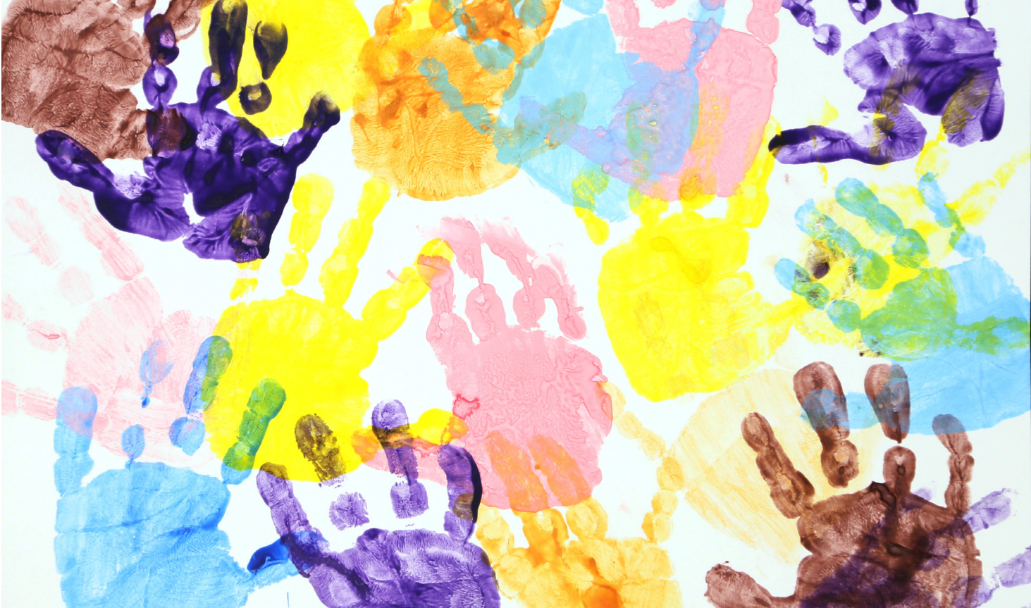
All art work created by children of Four Winds.