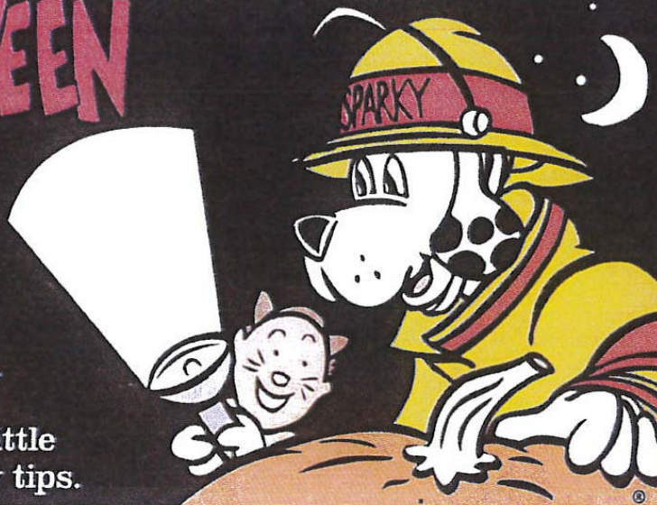
Sparky® is a trademark of the NFPA.

Halloween is a fun, and spooky, time of year for kids. Make trick-or-treating safe for your little monsters with a few easy safety tips.