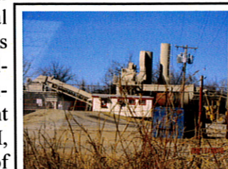
Paving (gravel) company in the town of Carney (Lincoln County, OK)

Nonpoint Sources - smaller sources such as dry cleaners, gas stations, and auto body paint shops; small businesses; residences; dirt roads; prescribed fires/wildfires; waste disposal in the form of open burning,