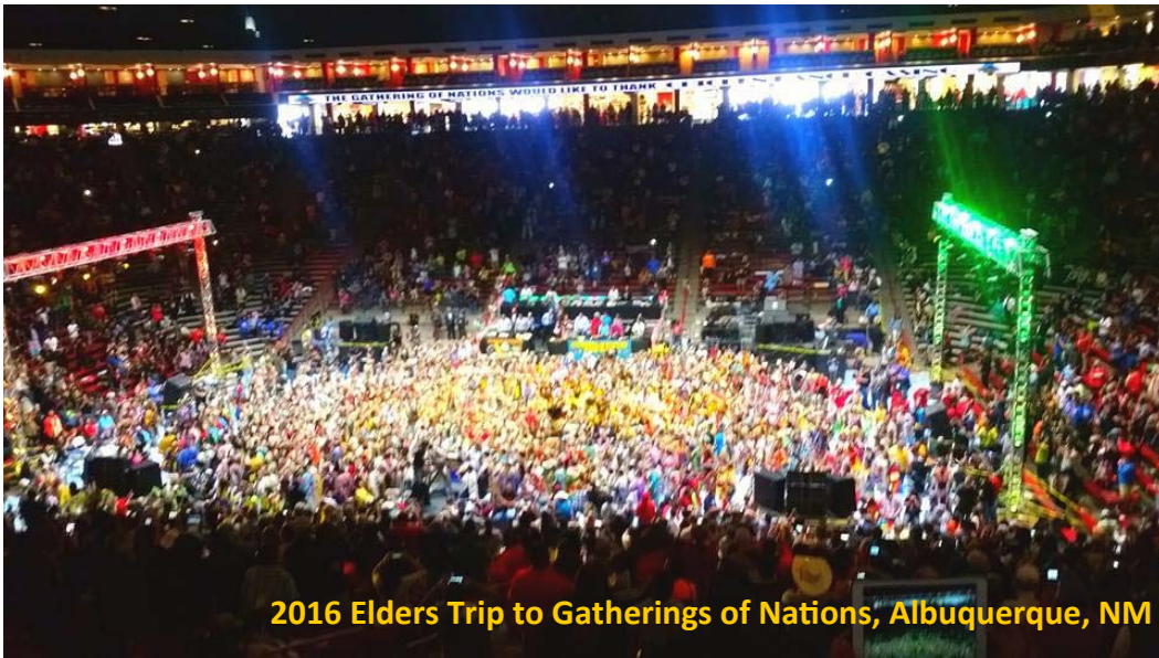
2016 Elders Trip to Gatherings of Nations, Albuquerque, NM